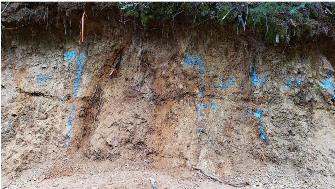
Eagle South - Showing Horizontal Channel samples B838726 to B838729 – 4.88 m photo width

Note: B838720 & B838730 were QAQC duplicates of the prior samples