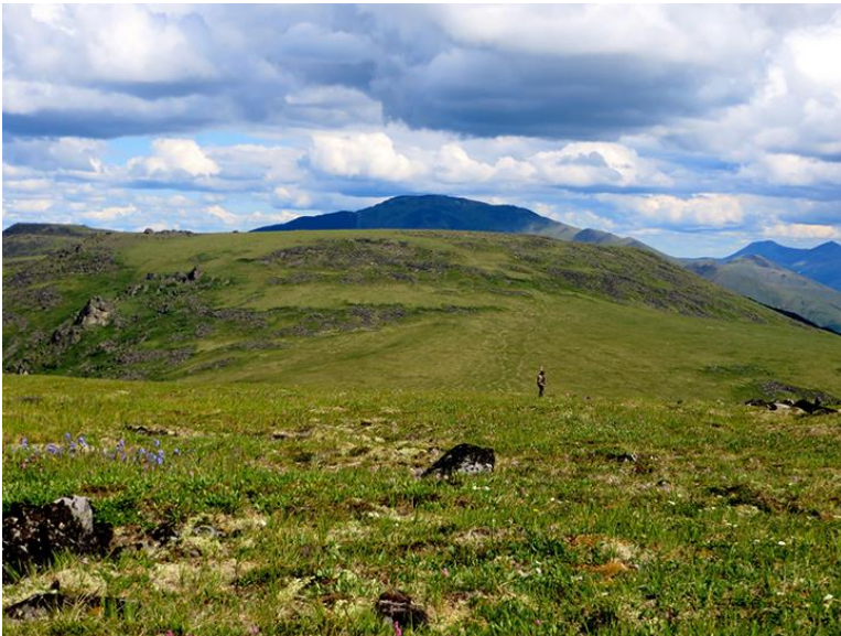
2017 IP crews at Elephant Mountain, Alaska